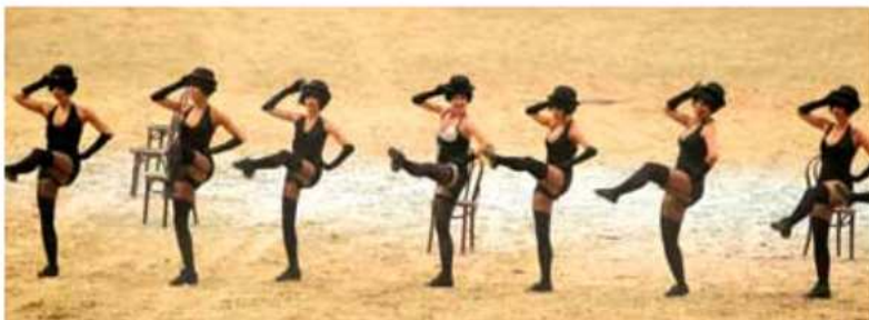
Euro 2013 also offers plenty of entertainment both in the arena and in the exclusive VIP section.

At the same time, the impressive VIP facilities offer many options for hospitality initiatives. The exclusive VIP section is in a class of its own, and perfect for tending to important customers and business connections. It is also important for our partners' hospitality initiatives to be as individual and personal as possible.