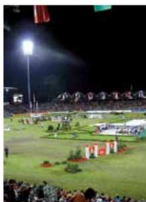
Medalling at the European Championships is second only to the Olympics and the World Championships.

In recent years, Danish riders have achieved many excellent results at international competitions. The fine-tuning is already underway, and expectations