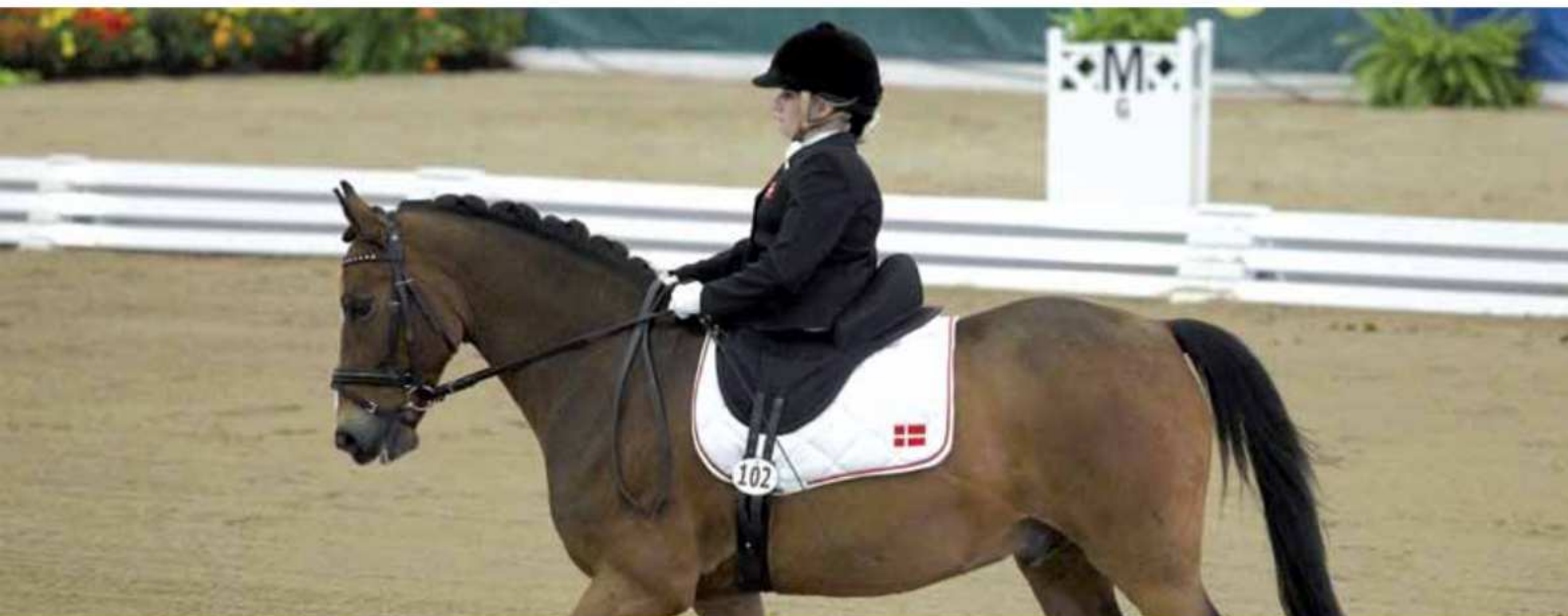
Para dressage: Watching equestrian sport for people with disabilities is an experience and the medals will be hard-fought.