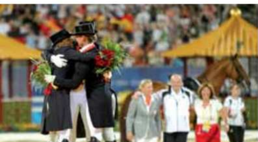
The major championships attract the elite, the public and television viewers.