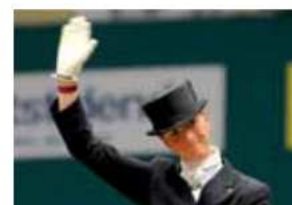
The global elite, including Denmark's Princess Nathalie, gathers for the European Championships.

Para dressage for people with disabilities does not mean that the competitive element is secondary - quite the reverse, in fact. And it is always impressive to see a disabled person working in partnership with the horse.