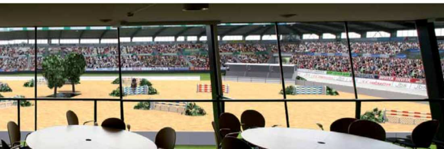
The MCH Arena sets the stage for first-class VIP and hospitality facilities.

to selected target groups and business connections with particularly discerning needs