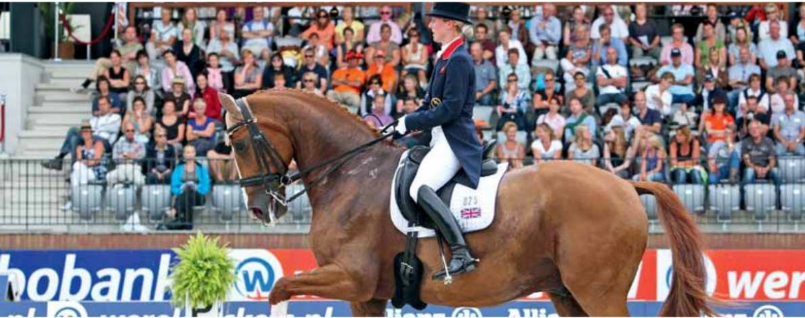
Dressage: The interplay between horse and rider is a fascinating discipline and always impresses.