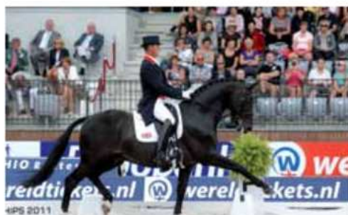
Billboard exposure reaches up to 15,000 spectators in the arena and many television viewers.

ECCO has signed on as an Event Partner, and there is an opportunity to be Title or Presenting Partner for one or more competition categories. This provides exposure closely linked to the sporting world, with associated ownership of the event.