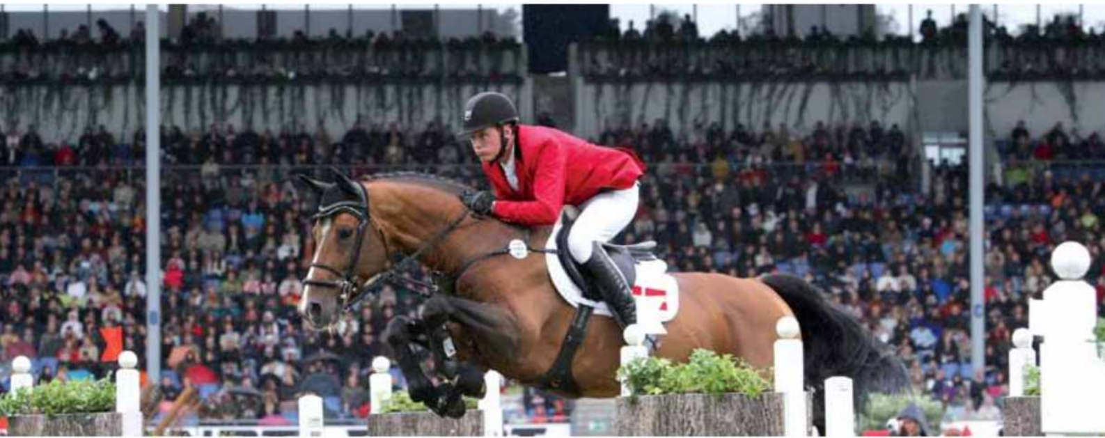
Jumping: The show-jumping is traditionally nerve-wracking from start to finish.